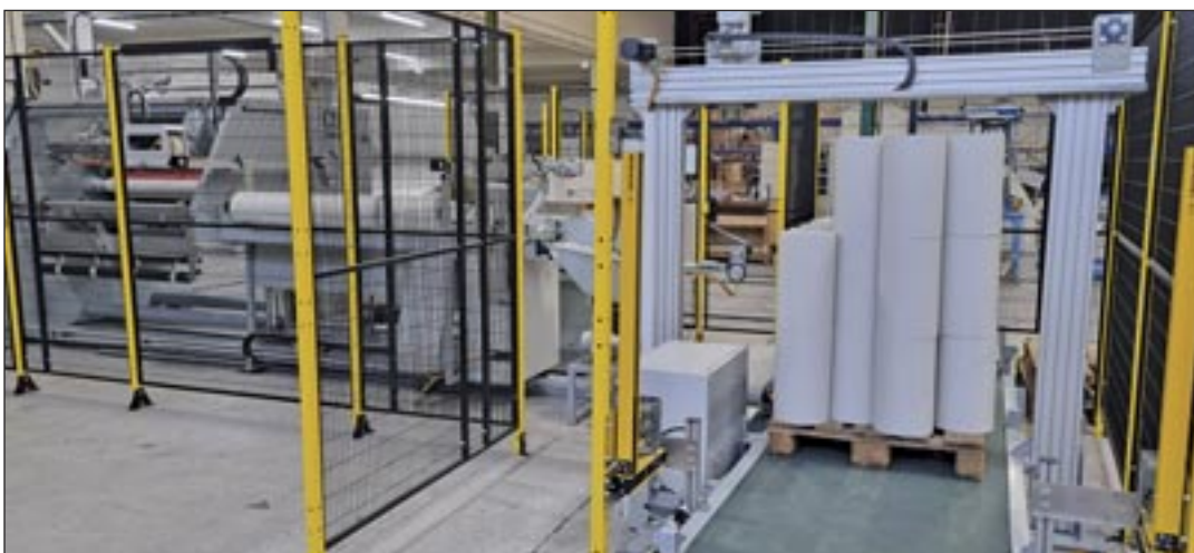
Automatic pick and place palletising