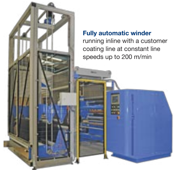
Fully automatic winder running inline with a customer coating line at constant line speeds up to 200 m/min