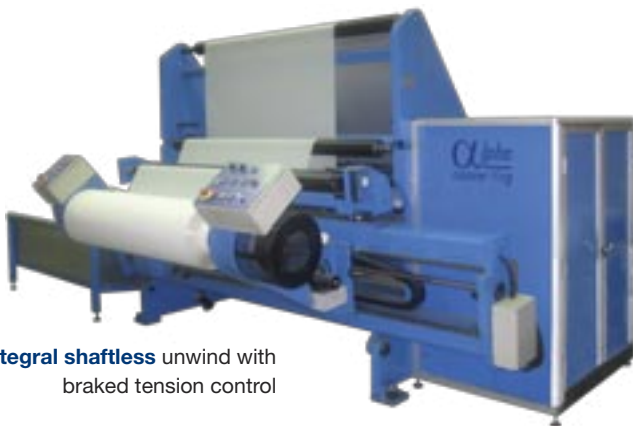
Integral shaftless unwind with braked tension control

Wide choice of printing options on labels, roll closure tape or direct onto the web